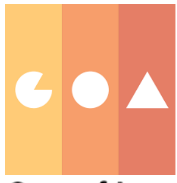
Game of Apps

Registration: <a href="https://gameofapps.org/register">https://gameofapps.org/register</a>